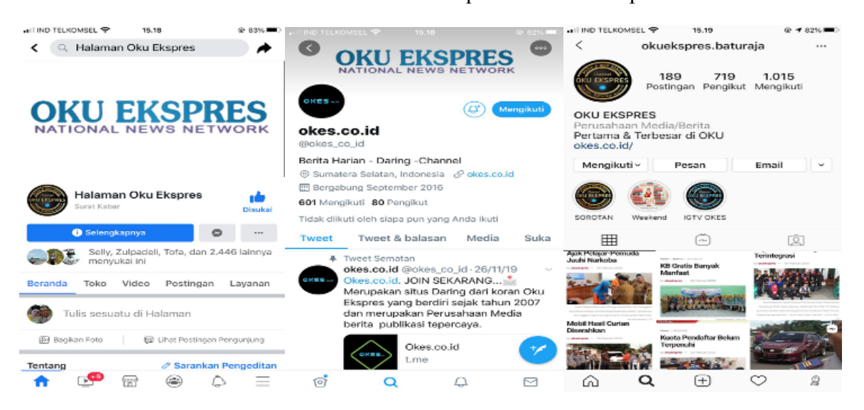
FIGURE 2. Display of OKU Ekspres Facebook, Twitter and Instagram

Alva also emphasized that the decision to enter social media was also based on the latest facts. Previously, social media accounts were more individual, official but now institutions with various activities (state and government institutions, private companies, political parties, mass organizations, associations and so on) also has an account on social media, as a bridge to communicate with the public. This potential, according to Alva, is also used as a penetration opportunity for OKU Ekspres to introduce their products. Public space on social media is