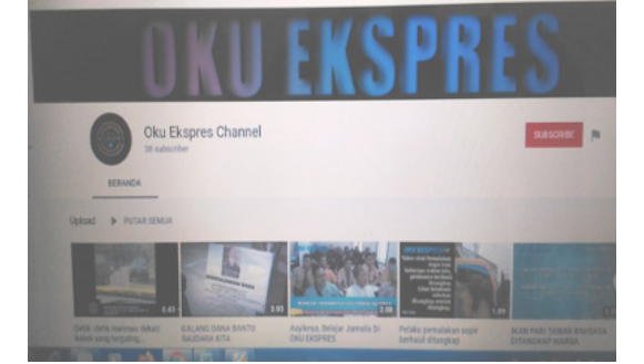
FIGURE 3. Display of OKU Ekspres YouTube Channel

Why has public media relations become so important? If you look at