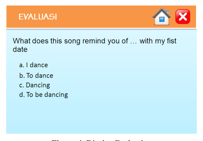
Figure 4. Display Evaluation