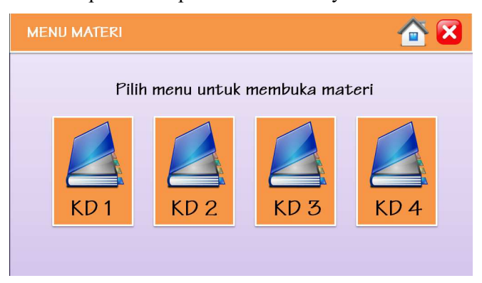
Figure 2. Display Main Material

in the media. The material to display competence. materials to appropriate. Evaluation used to display evaluation that is to the media. A profile for profiles and the key out used to end / out of the media.