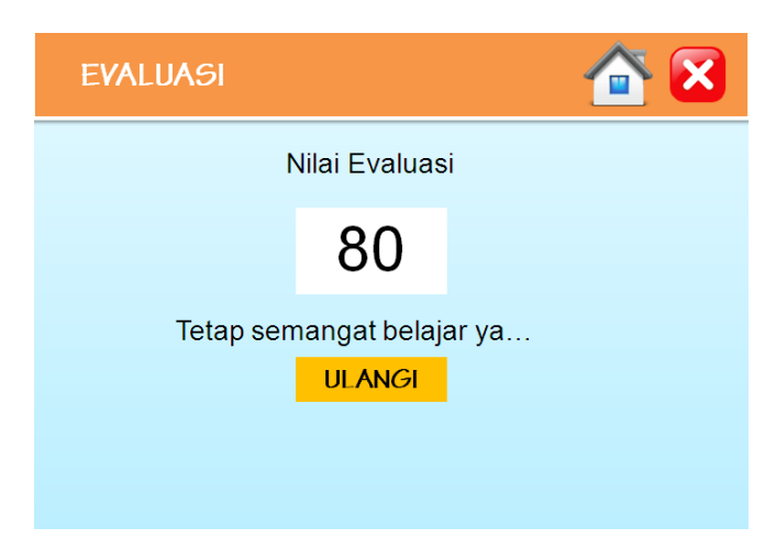
Figure 5. Display Evaluation Result

The results were to be seen after the work has been completed / answered. The score of the about evaluation will look after the final finished answered. If we want repeat doing the evaluation, students it clicked the repeat. Application to about the evaluation of number 1 will to finish.