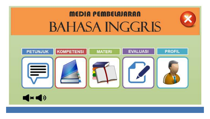
Figure 1. Main Menu

The final result of the media is learning based on android used as media learning. Consisting of pages applications that connect, there is media learning android based on the subjects of english class IX this having the appearance of as follows: