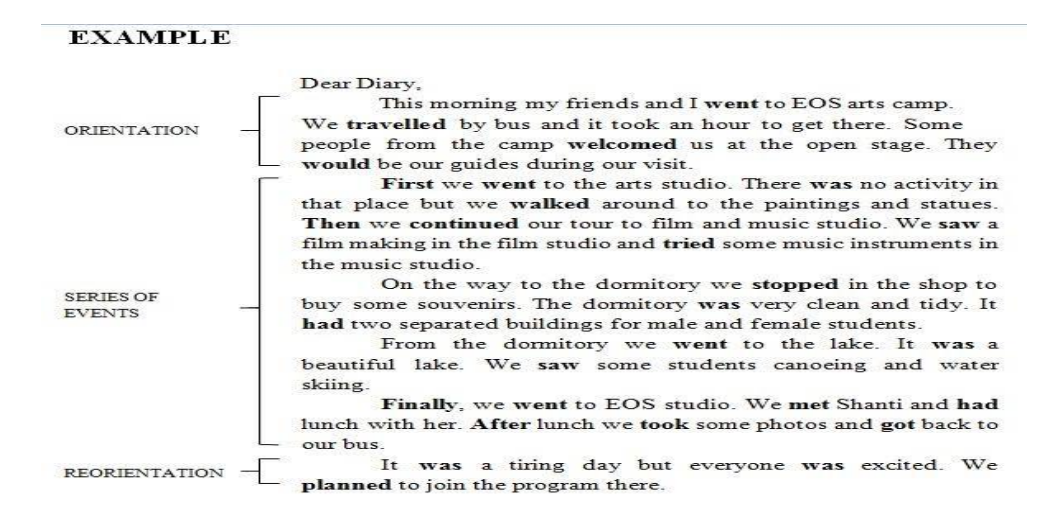
Example of Recount Text (adapted from smpnegeri5sleman.blogspot.com.2021)

Incident reports, newspaper reports, police reports, article, letters, journals, historical accounts, diary entires.