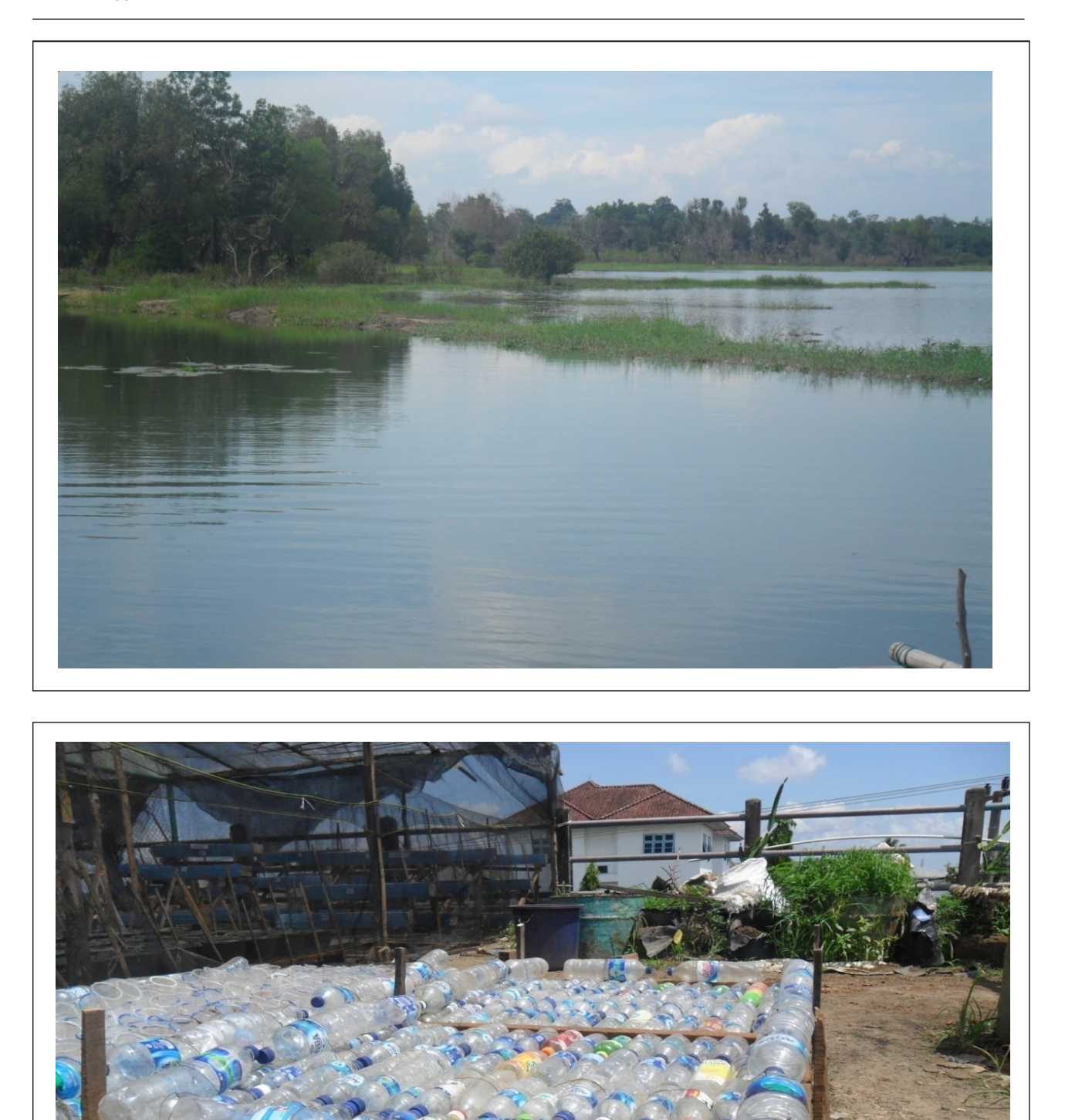
This article can be downloaded from http://www.ijerst.com/currentissue.php