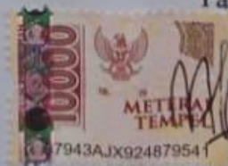
Melynda NPM 1823009