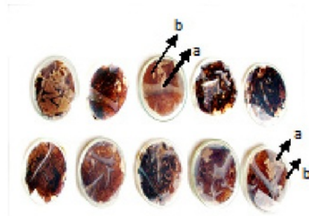
Note: a (bacteria colony), b (oil liquid waste)