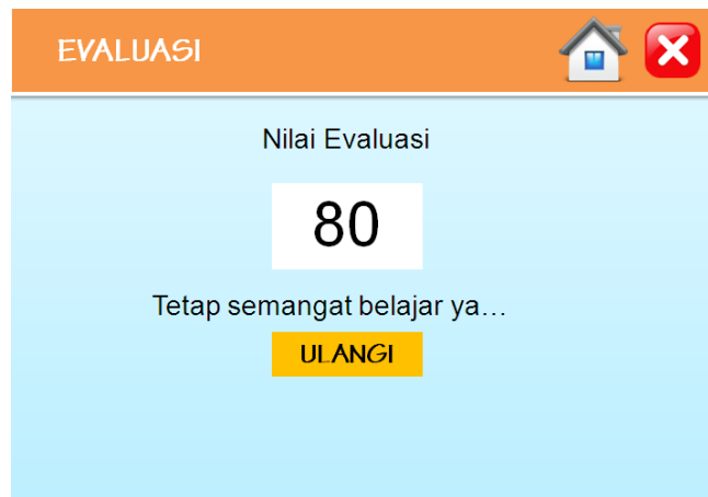
Figure 5. Display Evaluation Result

The results were to be seen after the work has been completed / answered. The score of the about evaluation will look after the final finished answered. If we want repeat doing the evaluation, students it clicked the repeat. Application to about the evaluation of number 1 will to finish.