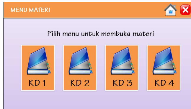
Figure 2. Display Main Material

in the media. The material to display competence. materials to appropriate. Evaluation used to display evaluation that is to the media. A profile for profiles and the key out used to end / out of the media.