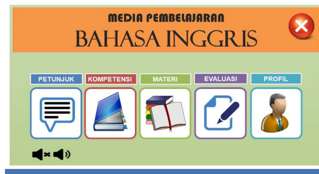
Figure 1. Main Menu

The final result of the media is learning based on android used as media learning. Consisting of pages applications that connect, there is media learning android based on the subjects of english class IX this having the appearance of as follows: